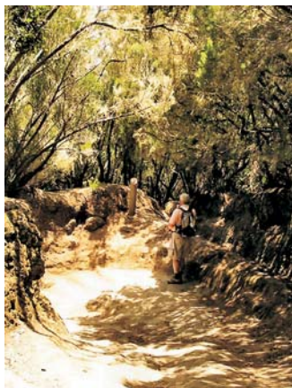
At the '3' marker post

Access by bus: Titsa services N°s 75 & 76 link La Laguna with Cruz del Carmen ; check current timetables to confirm times and return services.