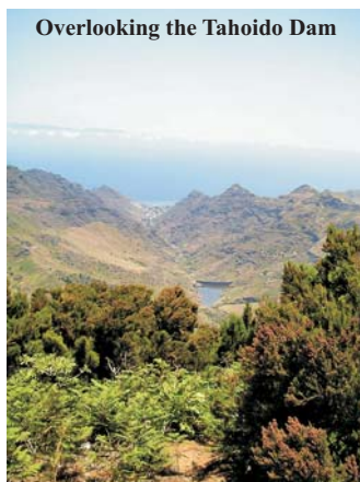
Overlooking the Tahoido Dam

From the car park signboard (Wp.1 0M) we stroll down the broad trail into the forest to pass the example of the craft of 'cut tree heather' (Wp.2) before coming to a wooden barrier (Wp.3) where we follow the main trail down to the right.